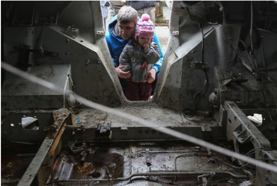
A father shows an armored personnel carrier interior to his daughter at the exhibition of Russian weapons captured in the Donbas during battles in eastern Ukraine.

This week Ukraine has been celebrating the first anniversary of the Euromaidan Revolution that toppled kleptocratic President Viktor Yanukovych. In the same week the second peace agreement signed in Minsk on Feb. 11 collapsed for the same reasons as the first Minsk agreement signed last September; then and now Russia and its separatist proxies failed to adhere to a single article of Minsk-1 or 2.